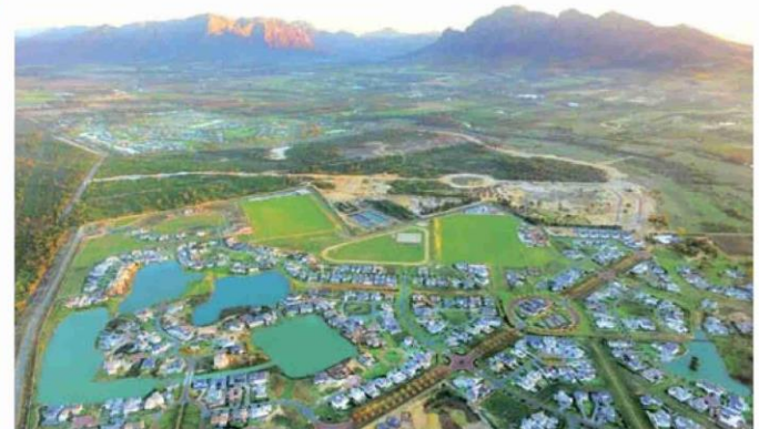
Val de Vie, Paarl