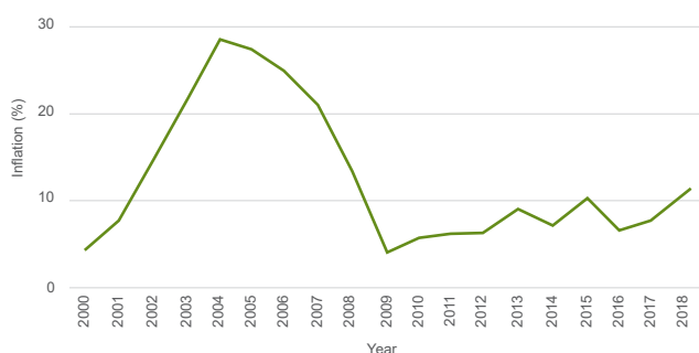
Lightstone Commercial Index Inflation

Municipality by Commercial Type Commercial Index Used