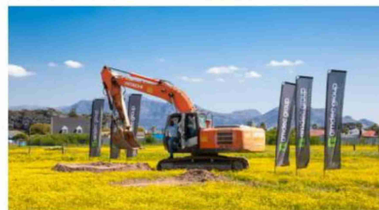
The site of Amdec's Golden Grove housing development in Ottery