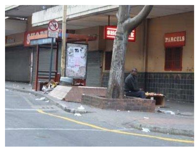
Eloff Street, Johannesburg

The 2002 edition of the South African Monopoly board underwent a serious makeover, where a lot of the traditional SA properties were swapped in favour of more exclusive real estate. Streets in Durban, Bloemfontein, Cape Town, and Johannesburg were replaced with cities, neighbourhoods and landmarks. Eloff street in Johannesburg (which, while it had become a less "desirable" property investment option, was still one of the more expensive streets in JHB), West and Smith streets in Durban and Long and Strand streets in Cape Town, no longer featured on the 2002 board. These spots were replaced by Plettenberg Bay, Franschhoek, Hyde Park and Sandton. Boksburg, Mitchells Plain and Soweto also featured on the board. Snapping up property in Clifton, the prime property suburb on the board, would set you back R40 000.